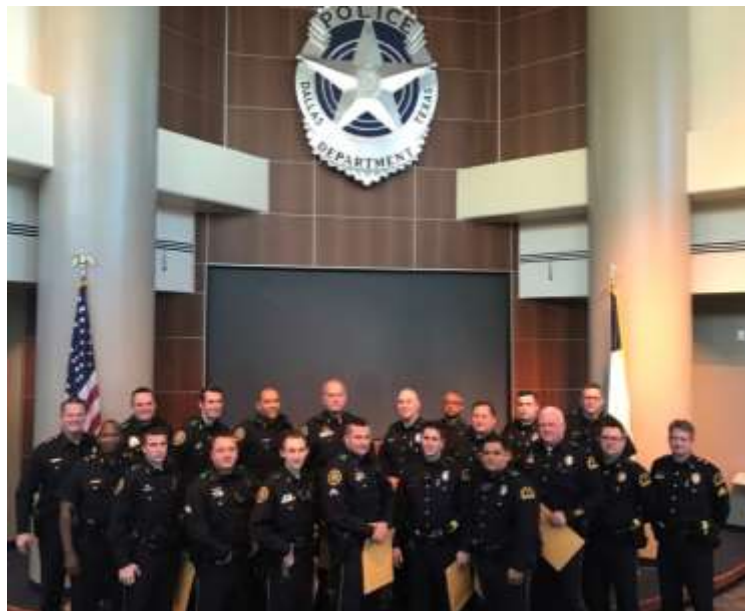
Dallas Police Dive Team