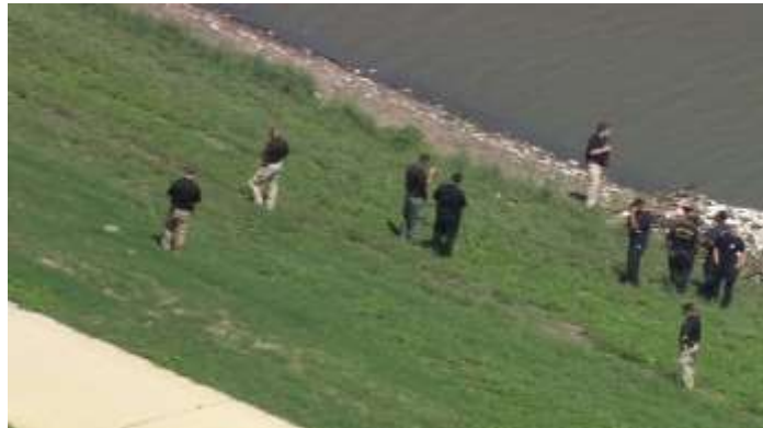
Authorities at scene where body found washed ashore at Trinity River levee in Dallas.